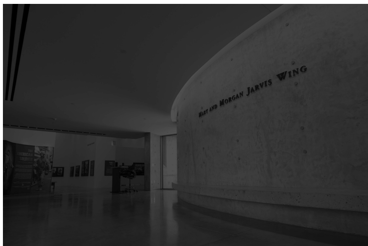
Looking through the entrance of the Mary and Marvin Jarvis Wing to the galleries, 2009