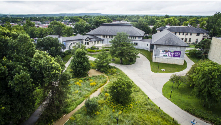
Aerial view of Beach Museum of Art and the Meadow, 2015