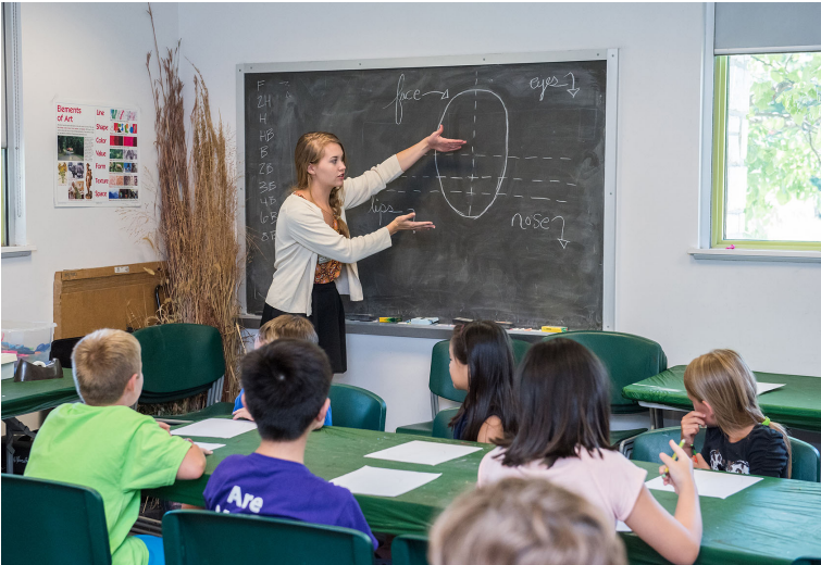
Young artists' class, 2016, Beach Museum staff photograph