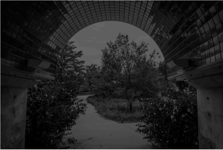
The Dan and Beth Bird Archway looking toward the meadow, 2015