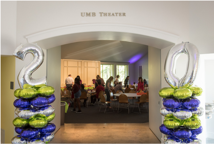
Celebrating 20 years at the Beach Museum of Art, 2016