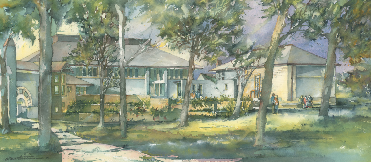
Watercolor of the Beach Museum of Art with the Jarvis Wing addition, 2003, Andersson-Wise Architects