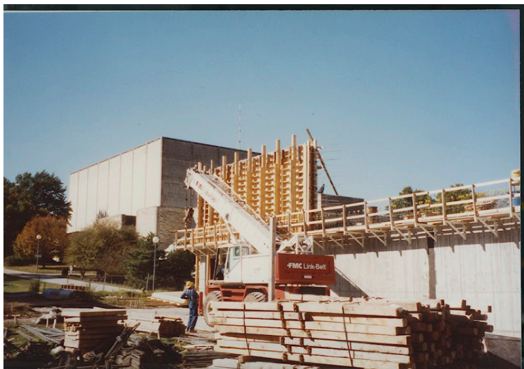
Construction underway for the Beach Museum of Art, ca. 1995