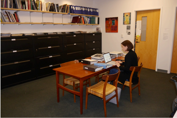
Visiting researcher utilizing Peine Curatorial Center resource materials, 2021