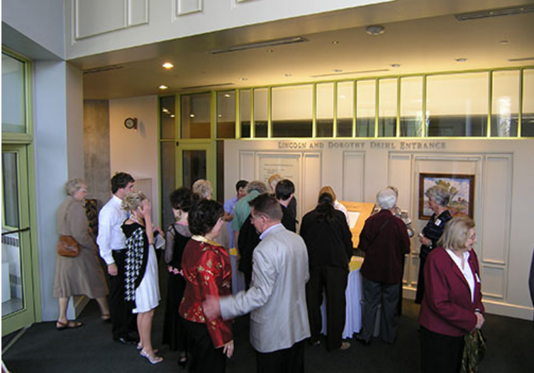
People entering the museum through the Lincoln and Dorothy Deihl Entryway, 2008, Beach Museum file photograph