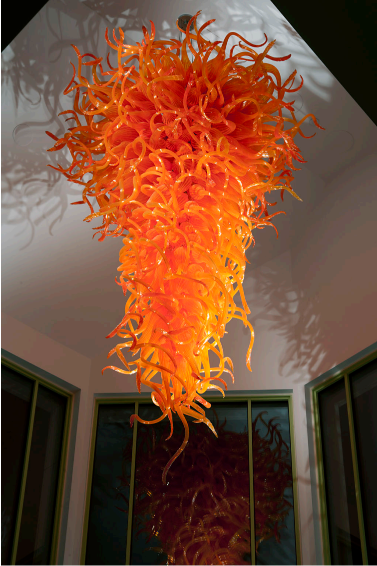
"Chandelier" by Dale Chihuly, 1996