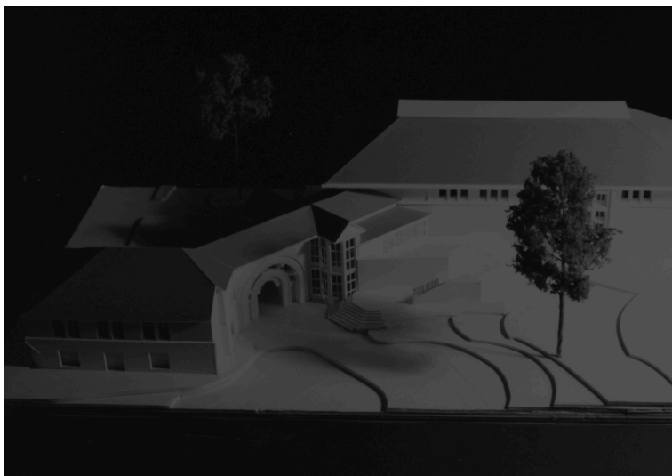
Building model for the Marianna Kistler Beach Museum of Art, ca. 1994