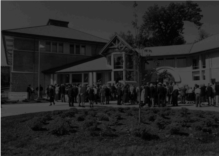
Opening day celebration for the Marianna Kistler Beach Museum of Art, 1996, unknown photographer