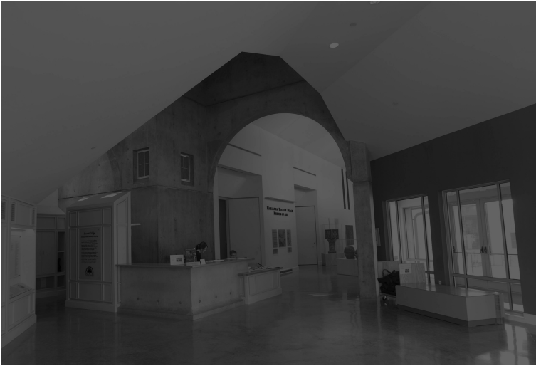
Entry onto the second floor of the Beach Museum of Art, 2009