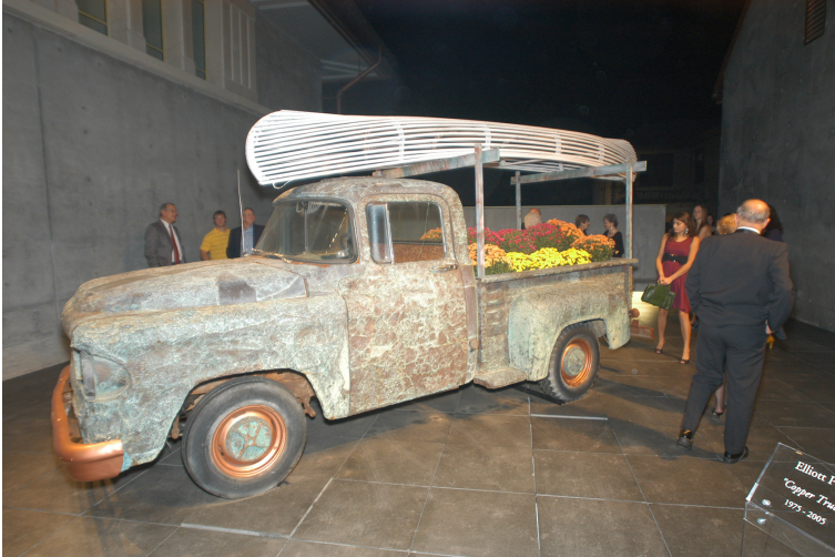
Installation of “Copper Truck” by Elliott Pujol shown in the Stolzer Family Foundation Gallery, 2007